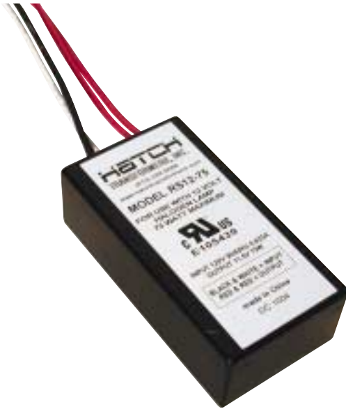
Plastic Case Models